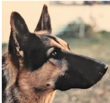
“Winnie” survived an episode of bloat at age 9 and lived to be 14 years old.

When her 9-year-old black and red female German Shepherd Dog, “Winnie” (Winnie vom Spezialblut SchH3 FH CD TT JH), came back from a routine bathroom break before bedtime with a life-or-death case of gastric dilatation-volvulus (GDV), MelloDee Middleton went into survival mode.